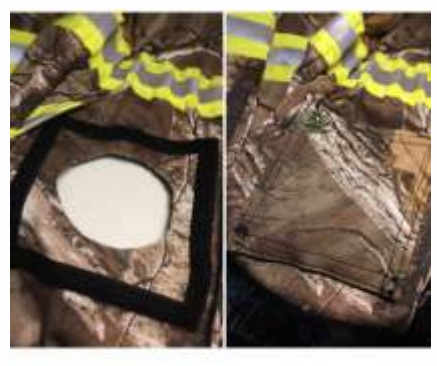
Cut re-inforced hole with velcro and cover, ready to accept the fan. Allows you to remove fans, put the cover on and use as a normal coverall.