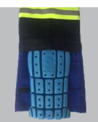
Protect the Knees: Open the velcro closure, insert the knee armour into both leg slots, and seal the velcro closure. Knee armour is the larger of the two armour sizes.

Armour Ready allows the worker to insert knee, elbow and back/tailbone pads right into the garment. This provides additional protection against impact injuries or trips and falls without having to wear commonly uncomfortable external pads. These painful injuries are costly to workers, and employers alike. Armour Ready's design may not eliminate all claims, but will definitely reduce the number of impact or fall injuries.