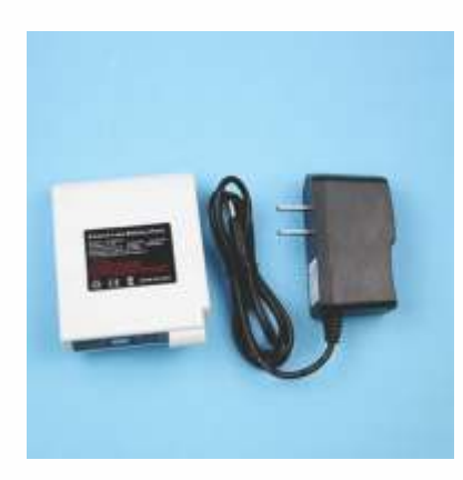
Lithium ion rechargeable battery pack and charger.