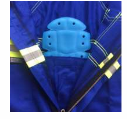
Protect the Tailbone: Open the coverall, open the velcro closure on the tailbone slot and insert the smaller of the two armour sizes. Seal the velcro closure. For coveralls sizes 48R-70T use the larger Armour.