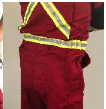
Cool Your Core