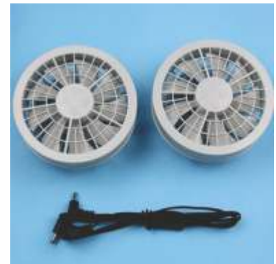
Two fans with connector cables.