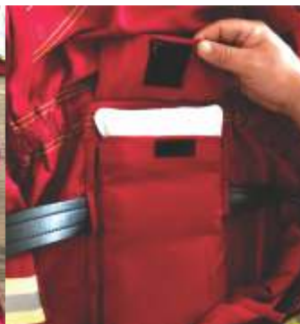
Insert Cool Pack