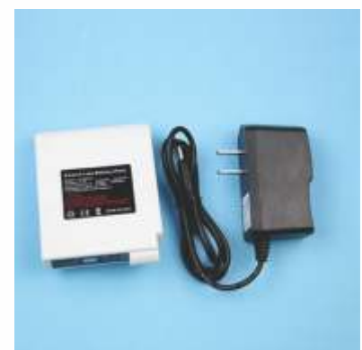
Lithium ion rechargeable battery pack and charger.

Cut re-inforced hole with velcro and cover, ready to accept the fan. Allows you to remove fans, put the cover on and use as a normal coverall.